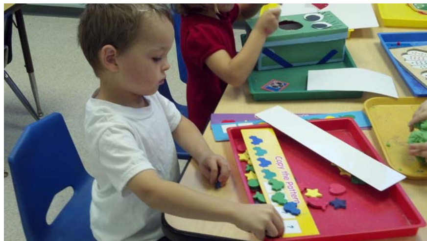
Pattern making at TTZ.