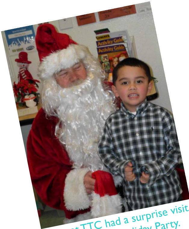
Children at TTC had a surprise visit from Santa at their Holiday Party.

month, especially when they were asked about their families. And on game day the children at Tiny Tot Neighbors really liked playing color and shape bingo.