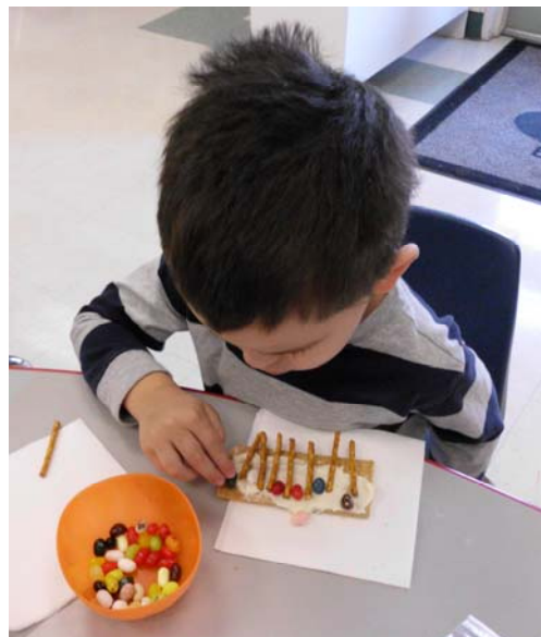
Children made edible Menorahs while learning about Hanukkah.