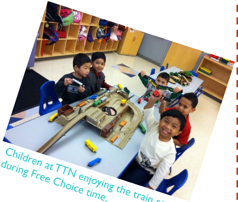
Children at TTN enjoying the train set during Free Choice time.