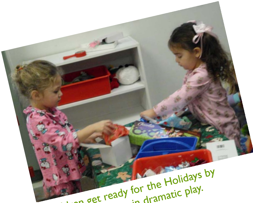
Children get ready for the Holidays by wrapping presents in dramatic play.