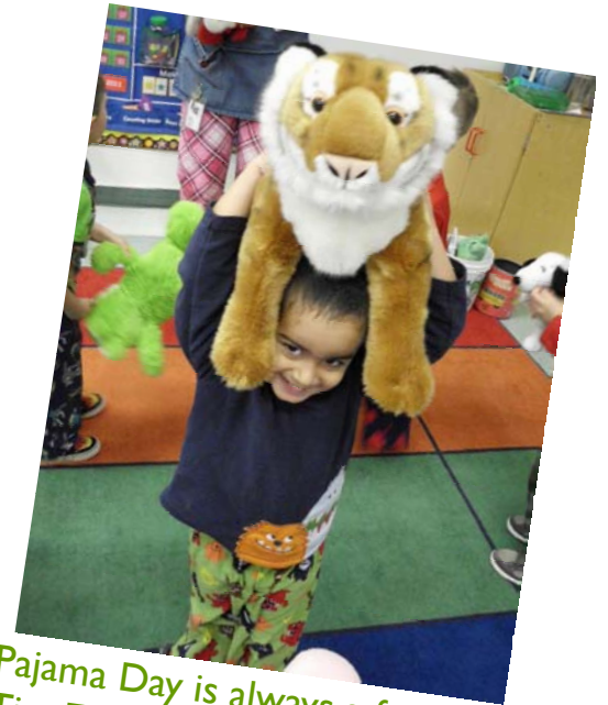
Pajama Day is always a fun day at Tiny Tot Preschools.